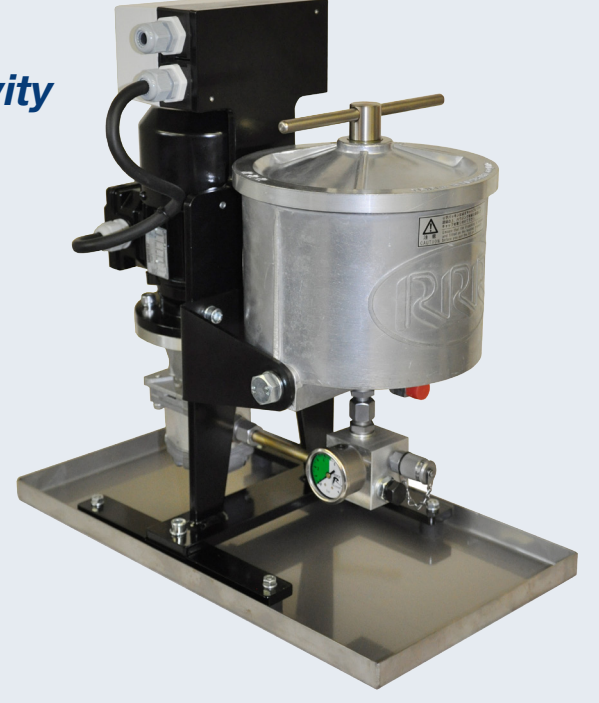
SE100E-BH with optional leakage tray